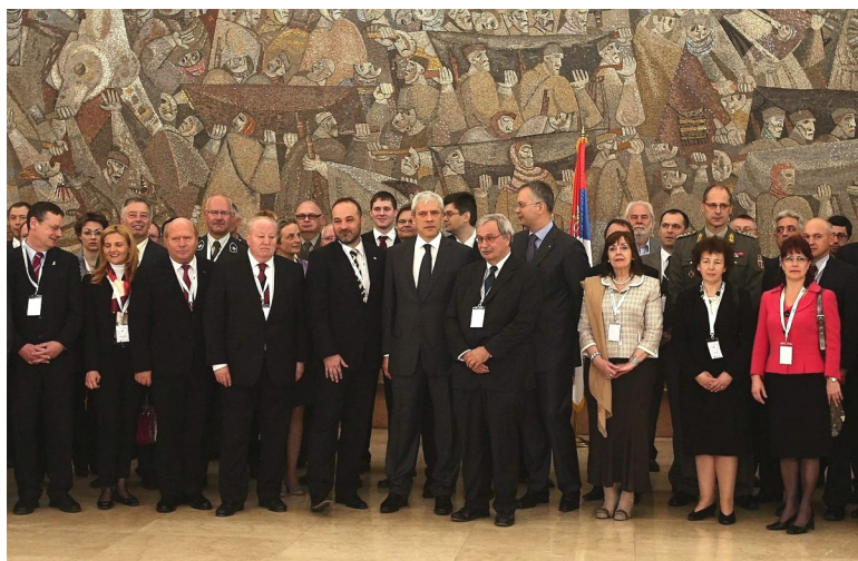
photo 1 - Conference participants