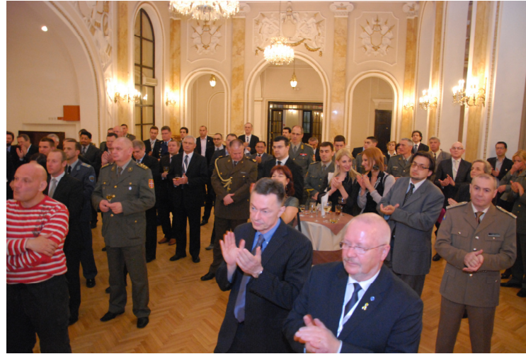
Photos 5, 6 7 – Hosts and guests at the reception in the Club of the Serbian Army “Topčider”